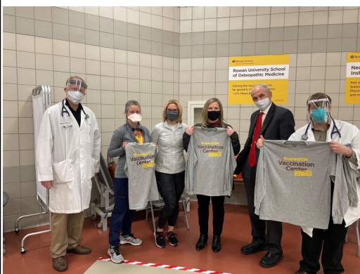
Rowan University's School of Osteopathic Medicine kicked off "Operation Saving Lives" and is among the list of sites.

In January, New Jersey will launch its online vaccine scheduling system to further help Phase 1A recipients to identify vaccination locations and schedule appointments.