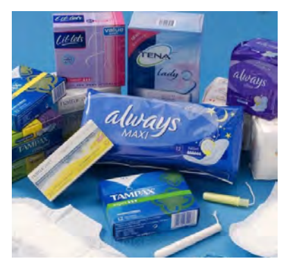
Feminine hygiene products