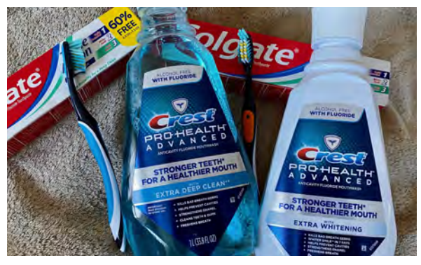
Toothpaste, toothbrushes, mouthwash, dental floss