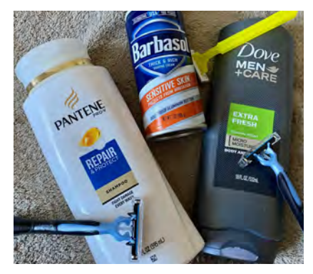
Shampoo, shaving cream, razors