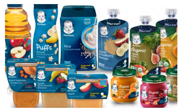
Baby Products: baby food, formula, pediasure, etc.