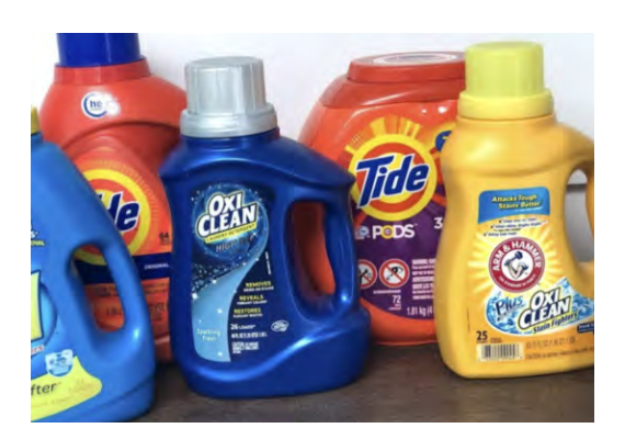
Laundry detergent, dishwashing detergents