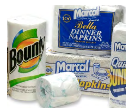
Toilet tissue, paper towels, napkins